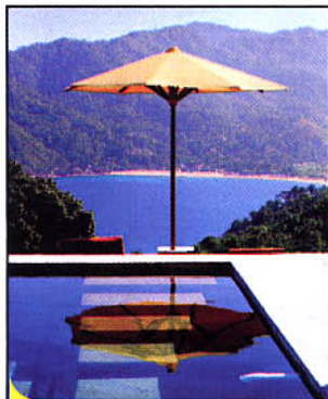
VERANA, YELAPA, MEXICO

The offspring of two former Hollywood set designers, this rustic eco-resort, perched above a deep blue Pacific bay, earns our vote as the most romantic place on the planet. Couples therapy, Verana style, includes daily trips to a private beach, jaw-dropping whale sightings, and unlimited tacos.