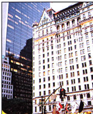
THE PLAZA, NEW YORK

This newly renovated grande dame has made more appearances in rom-coms than Matthew McConaughey. Executive-produce your own love story: After a complimentary glass of wine at Caudalie Vinotherapie Spa, head down to the Oak Room, where banker bachelors blow their bonuses like it's 2007.