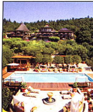
AUBERGE DU SOLEIL, NAPA VALLEY

Anxious about your first weekend away? At this Napa Valley hideaway, it's acceptable to self-medicate at wine tastings. By the end of the weekend, you'll not only know your Cabernets from your Shirazes, but also whether Mr. Right Now is Mr. Right.