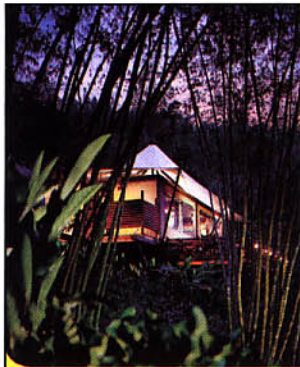
FOUR SEASONS GOLDEN TRIANGLE, CHIANG RAI, THAILAND

Skip Bora-Bor-ing for a glam-ping trip (posh tents with fancy sheets and Wi-Fi) at the Four Seasons Tented Camp Golden Triangle, Thailand. After touring the jungle on the back of an elephant (the transport of choice), learn how to use that wedding-registry wok at a Thai cooking class.