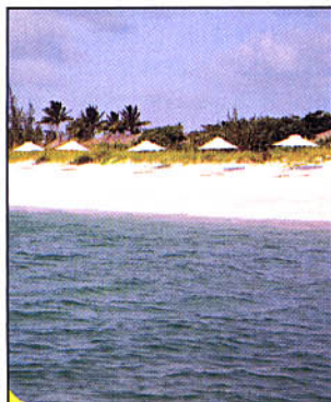
PARROT CAY, TURKS AND CAICOS