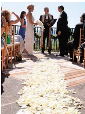
Clockwise from top: Dinner was served in the candlelit Clos Pegase wine cave; the newlyweds on the terrace; guests celebrate on the dance floor; table tags hang from wine bottles; centerpieces of florals and suspended candles. Below: The bride and groom exchange vows.